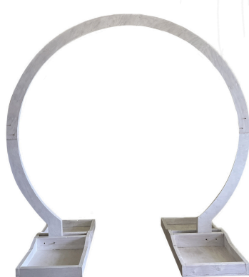
White Round Arch $325