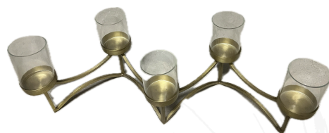
Candle Holder Does not come with candles $7 each