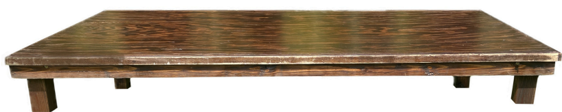
Dark Brown Low Table Seats 8-10 Pax L8ft W4ft H1ft $160