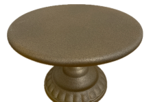
5. Bronze 10" Round $7