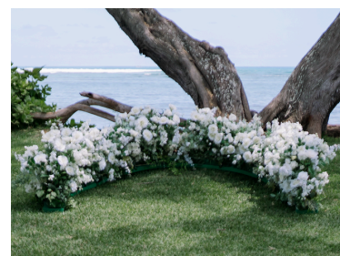
Floral Horseshoe Arch $325