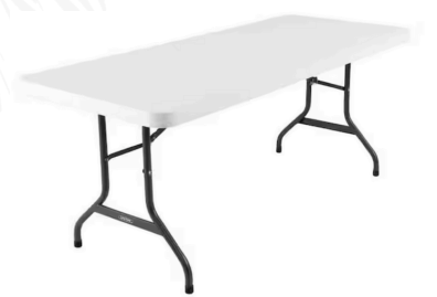
6ft Rectangle Table Seats 6-8 pax (L6ft W2.5ft H2.5ft) $18