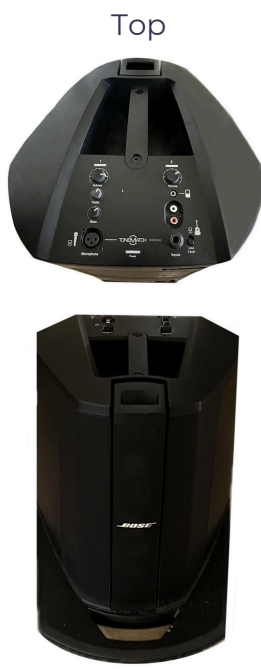
Sound System Rental $50