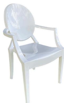
Acrylic Chair White $15