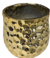
2 Gold Vase $7 each