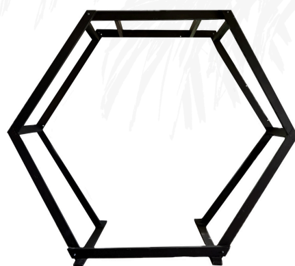
Brown Hexagon Arch $325