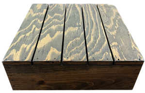
Large Wooden 24"x24" Box $7