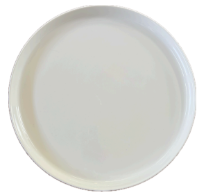
Large White 14" Round $7