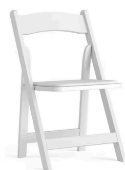
Folding Chair White $15