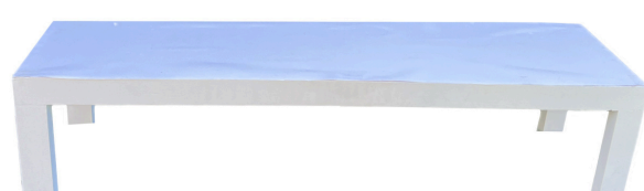
Benches (Seats 3-4 pax) White $15