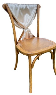
Crossback Chair Natural Brown $15