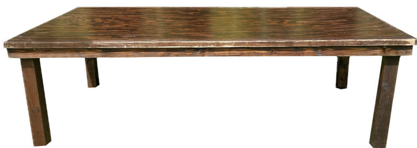
Dark Brown Farm Table Seats 8-10 Pax L8ft W4ft H2.5ft $160