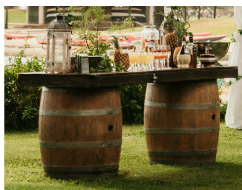
Rustic Bar Table Dark Brown $85