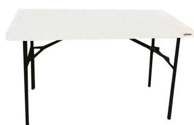
4ft rectangle Sweetheart Table (L4ft W2.5ft H2ft) $18