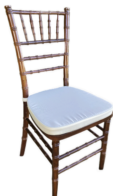
Chivari Chair Dark Brown $15