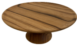
2. Wood 8.5" Round $7