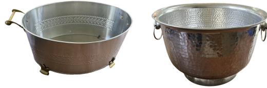
Beverage Bin 14"-19" $10