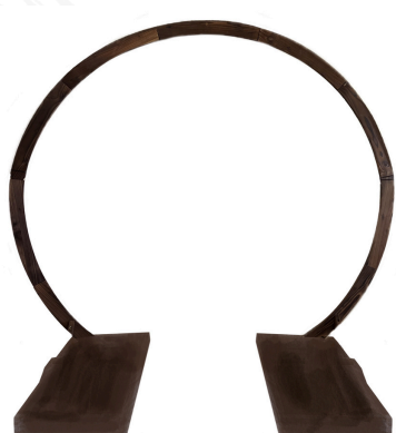
Brown Round Arch $325