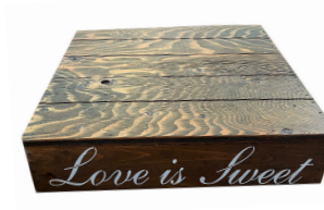
Love is sweet 18" x 18" Box $7