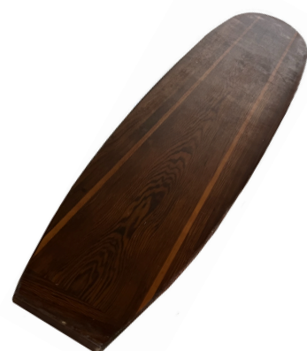
Surfboard Charcutier Board H: 6.5ft W:1.4ft $100