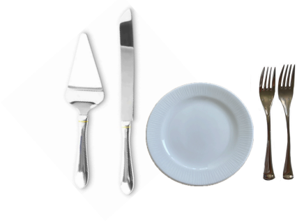
Cake Cut Set $10

Includes: Cake knife and server Plate 2 forks