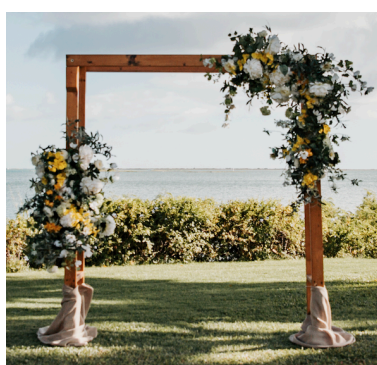
Brown Square Arch $325