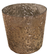
3 Copper Vase $7 each