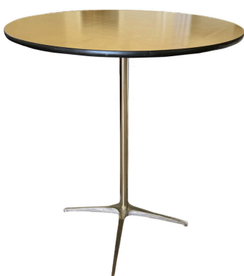
36 inch Round cocktail table Adjustable height: 30" or 42" $20