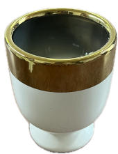
1 Gold rim Vase $7 each