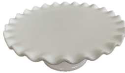
3. White 9" Circular $7