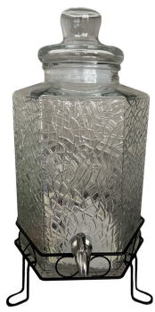
Drink Dispensers $10

Includes: Cake knife and server Plate 2 forks