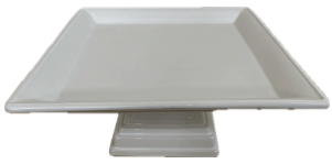
1. White 9"x9" Square $7