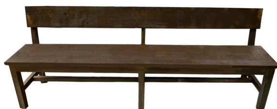
Benches (Seats 3-4 pax) Dark Brown $15