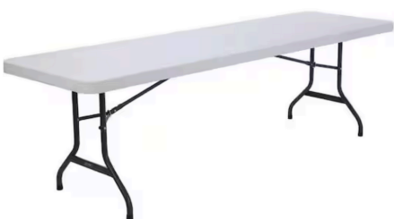
8ft rectangle Table Seats 8-10 pax (L8ft W2.5ft H2.4ft) $18