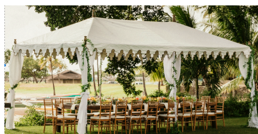
White Tent 10ft x 20ft $500