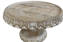
4. Rustic 10" Round $7