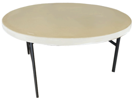
60 inch round table Seats 8 pax $18