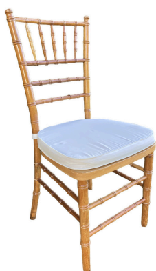
Chivari Chair Natural Brown $15