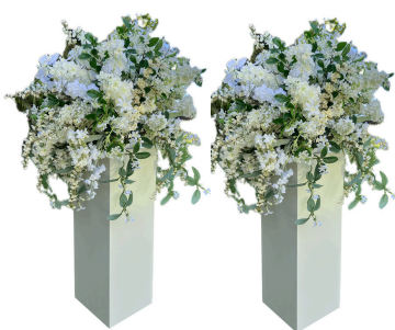
Floral White Pillars $50 per pillar